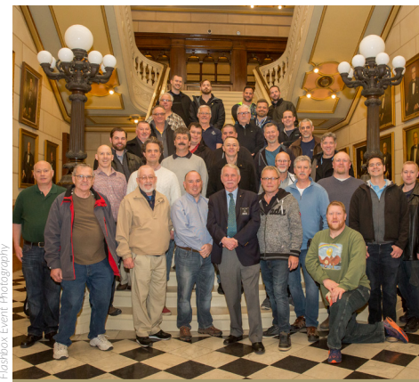
Floabox Event Photography