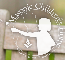
Bridget and Autumn